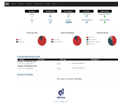
DAX's Web Configuration Application