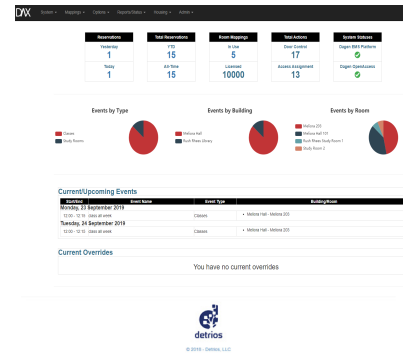
DAX's Web Configuration Application